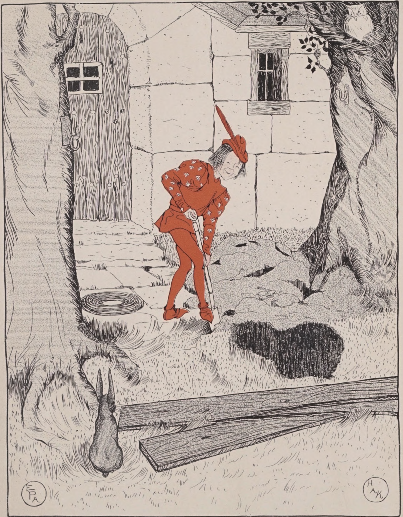
HE DUG A DEEP HOLE IN THE GROUND BETWEEN TWO TREES